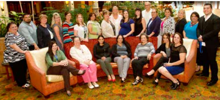
Trial Court Coordination – General Jurisdiction