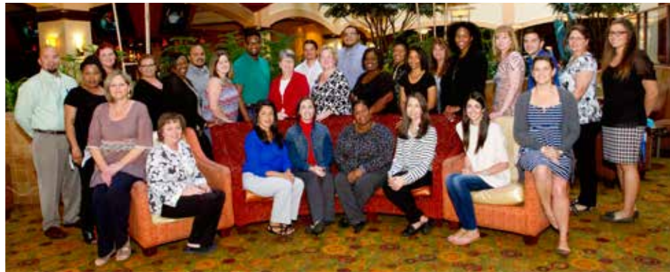
Trial Court Coordination – Specialty Jurisdiction