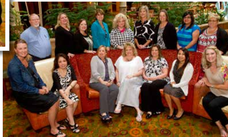
Trial Court Coordination – Rural/Multi-County Jurisdiction