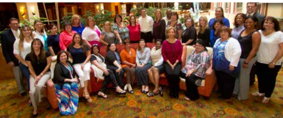
Court Management Program