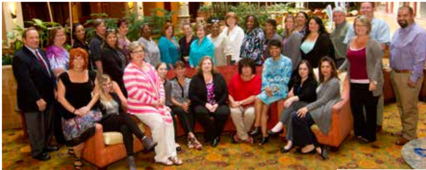
Trial Court Management